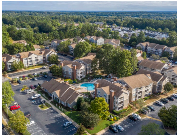
Windsor Falls Raleigh, NC