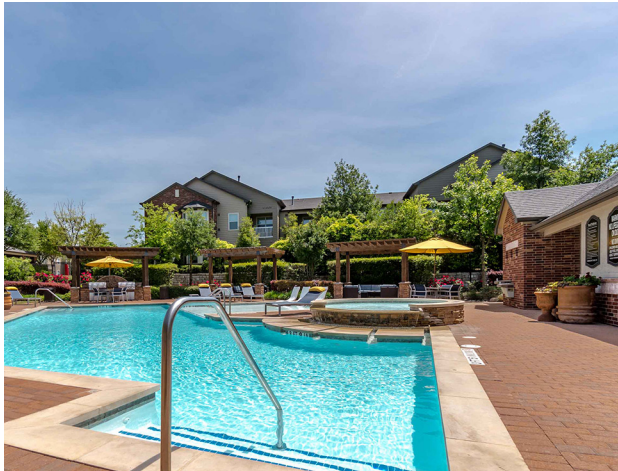
Palmer Place Austin, TX