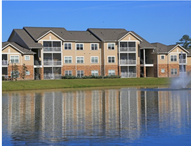
Waverly Station Pooler, GA