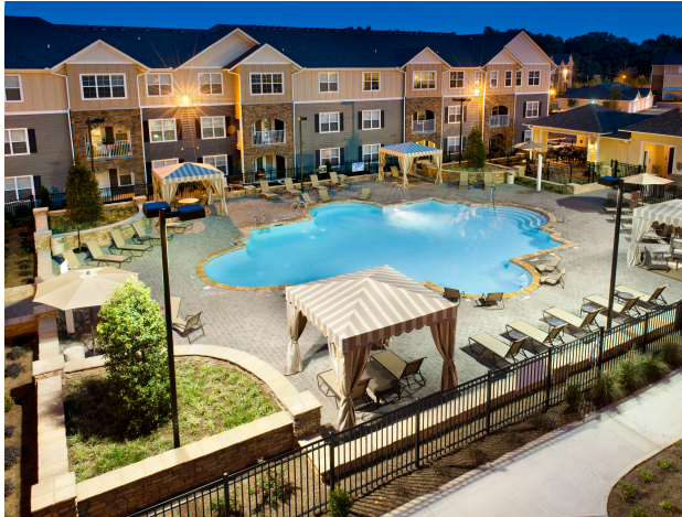
Trailside at Reedy Point Greenville, SC