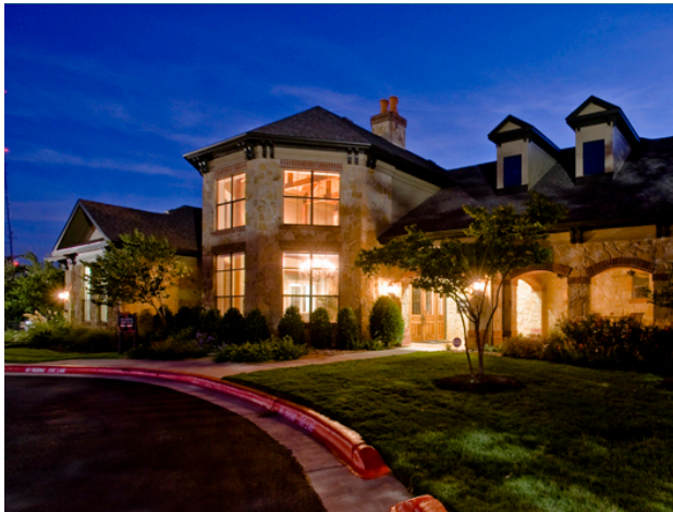
Elan Austin, TX