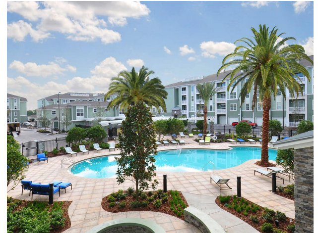
Pavilion at Lake Eve Orlando, FL