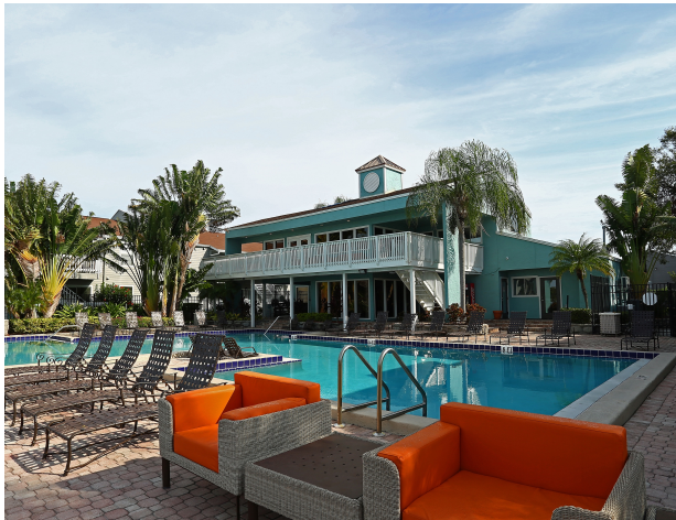
The Cove Tampa, FL