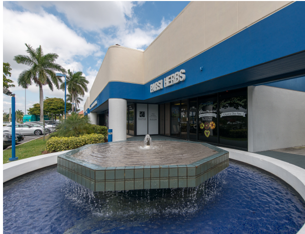
Buenvista Plaza Deerfield Beach, FL