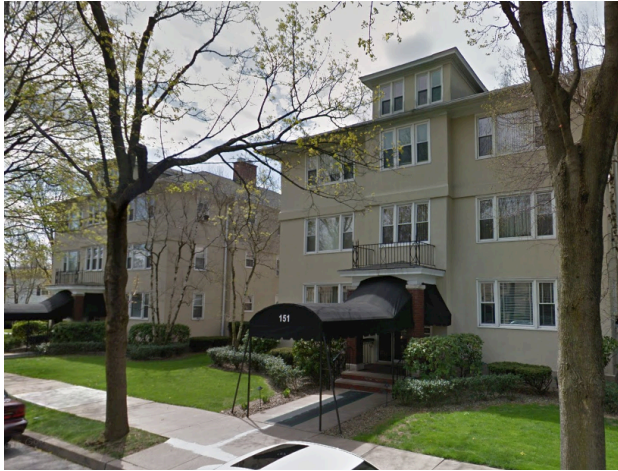
Chapin Portfolio Kingston, PA