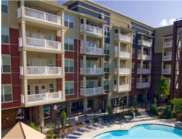
Pencil Factory Flats Atlanta, GA