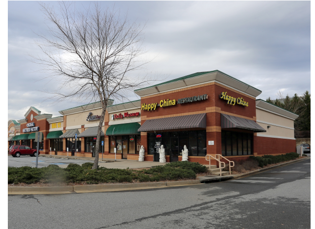
Weatherstone Promenade Woodstock, GA