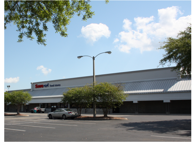
Main Street Station Jacksonville, FL