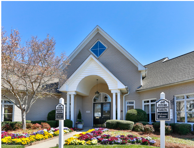
Whitehall Estates Charlotte, NC