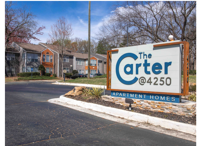
The Carter @ 4250 Norcross, GA