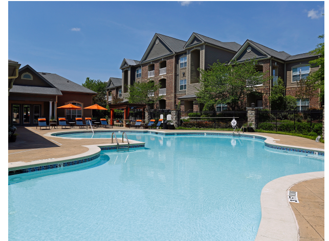
Carrington Park Raleigh, NC