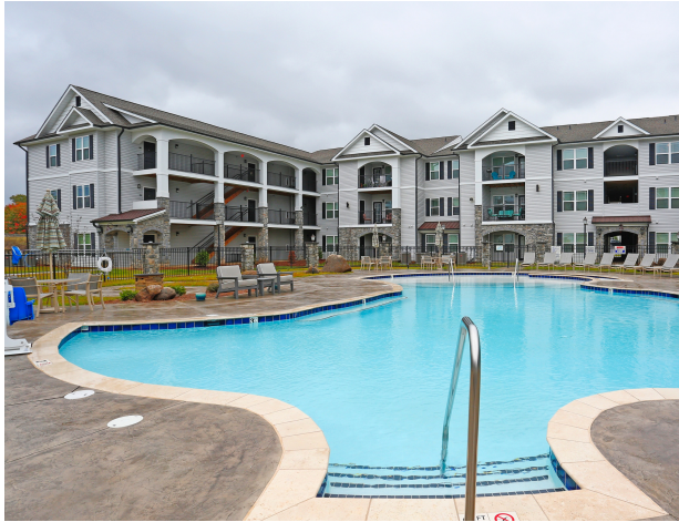
Laurel View Apartments Charlotte, NC