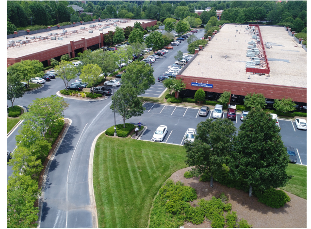
Sugarloaf Business Center Duluth, GA