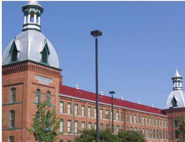
Enterprise Mill Augusta, GA