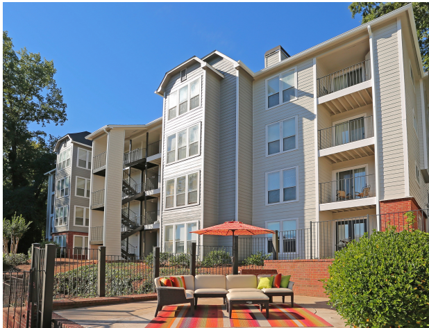
The Clarion Atlanta, GA