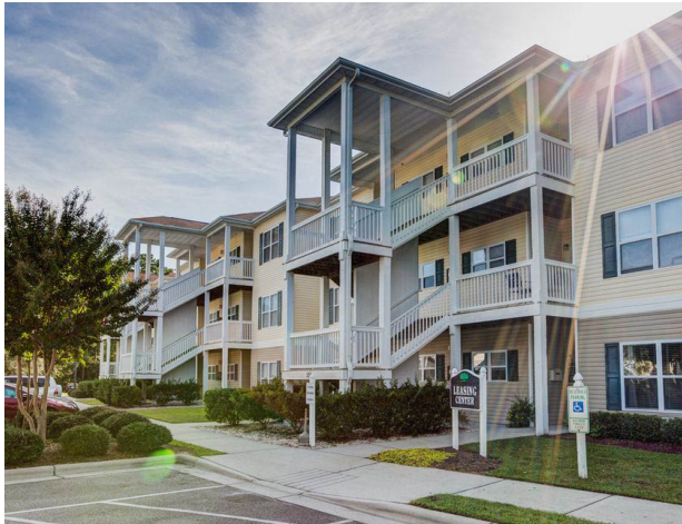
Park at Three Oaks Wilmington, NC