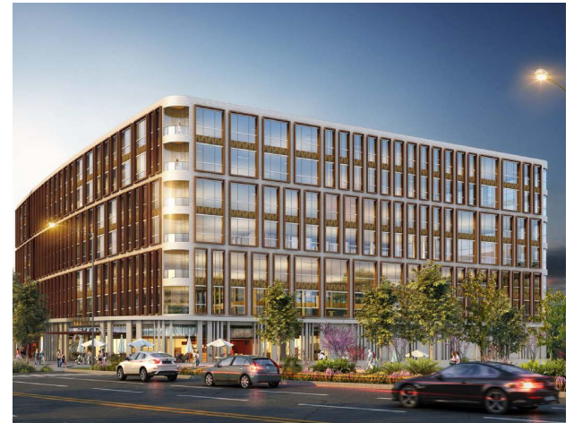
The Porter Brookhaven, GA