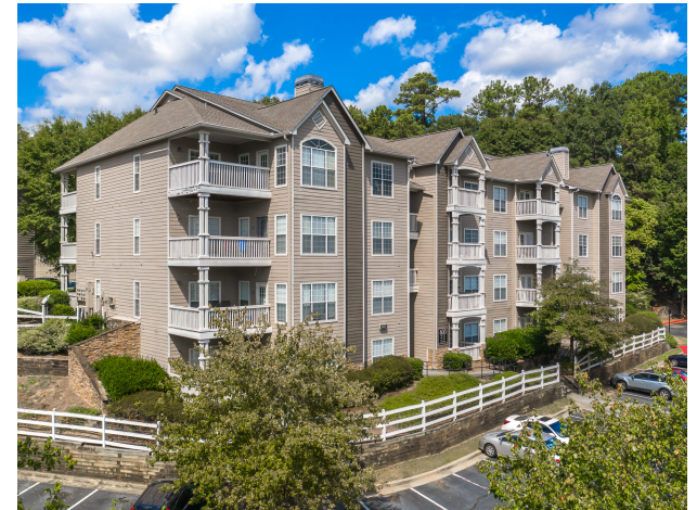
Elan Austin, TX